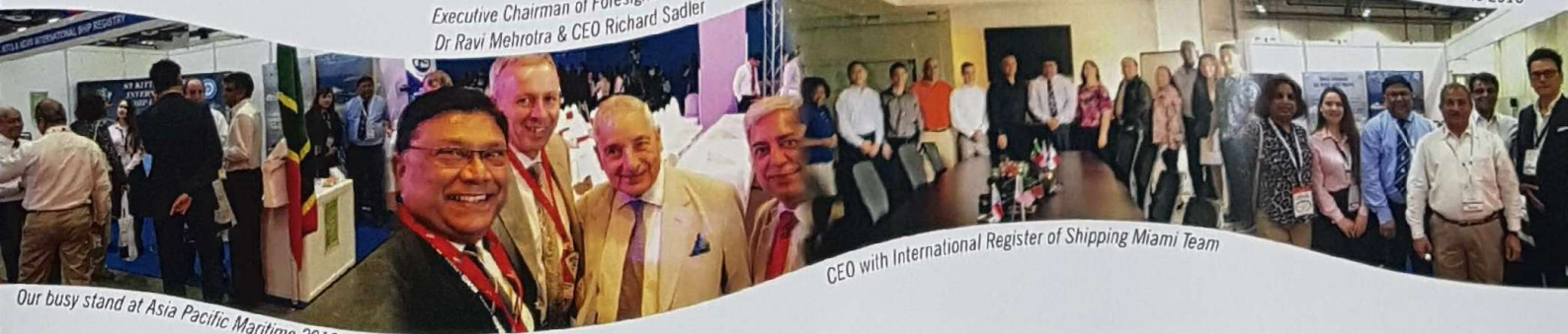
CEO with International Register of Shipping Miami Team