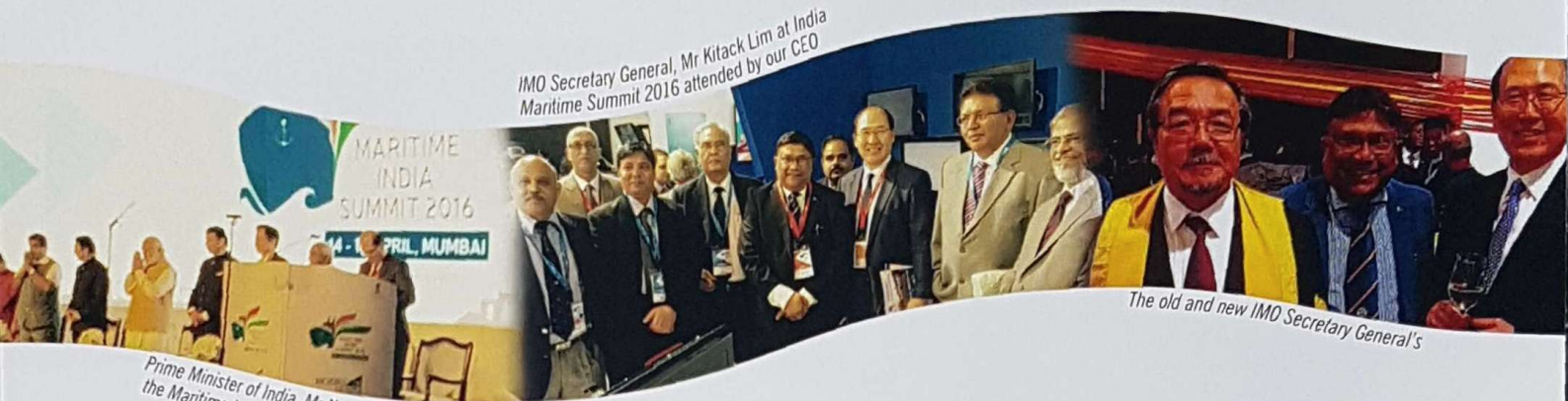
The old and new IMO Secretary General's