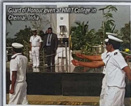
Guard of Honour given at HIMT College in Chennai, India