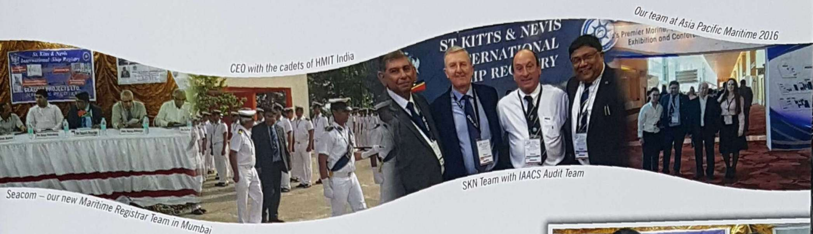
CEO with the cadets of HMIT India