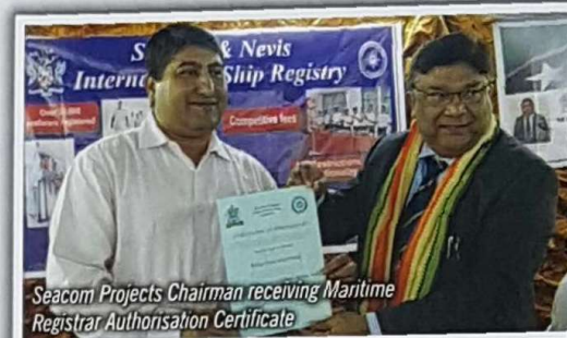
Seacom Projects Chairman receiving Maritime Registrar Authorisation Certificate