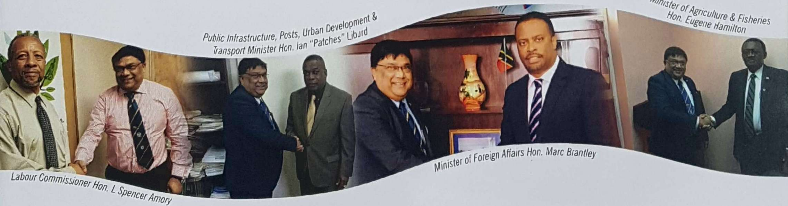
Public Infrastructure, Posts, Urban Development & Transport Minister Hon. Ian "Patches" Liburd