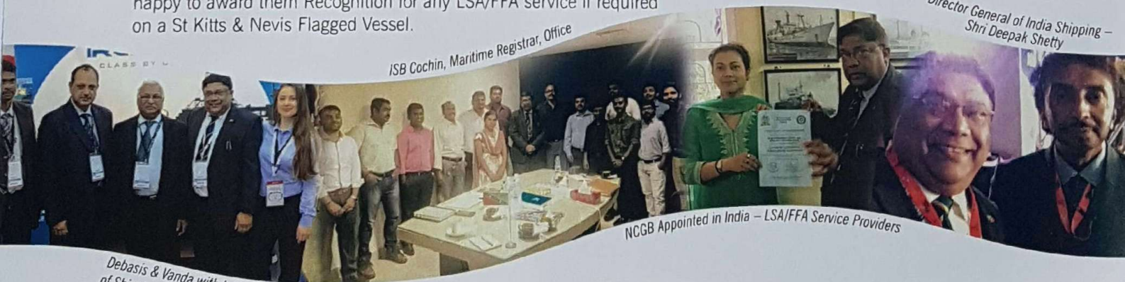
ISB Cochin, Maritime Registrar, Office